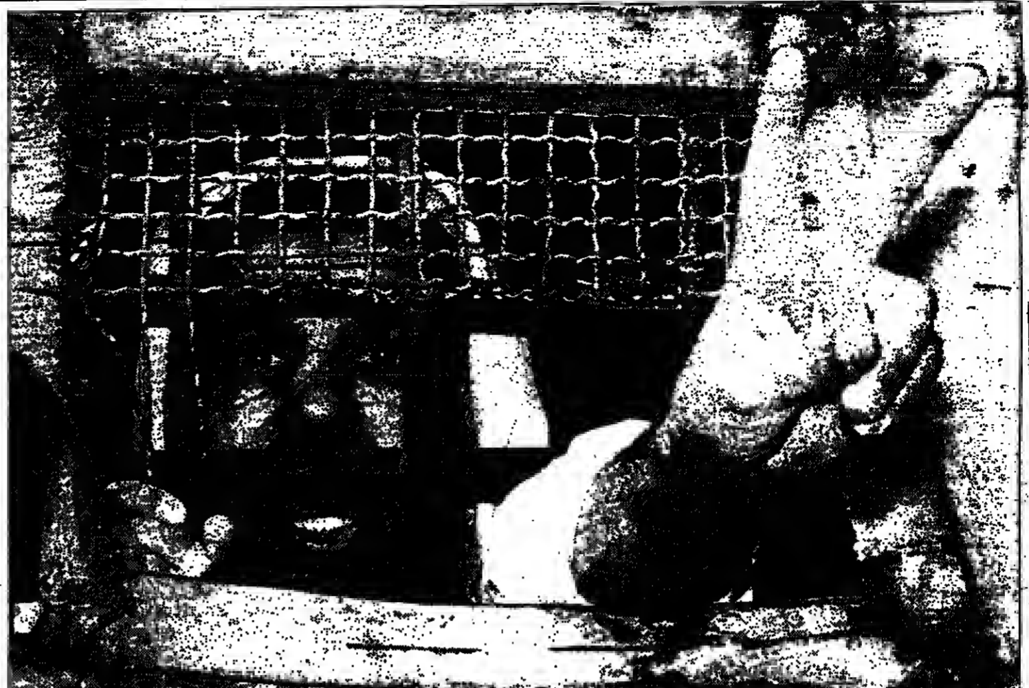
A Moslem militant waves the victory sign as he leaves a Cairo state security court yesterday. The court sentenced five Moslem militants to death for killing civilians and policemen in the south in 1993.

Klaus told reporters his country still expected to be among the first to join the alliance and added: "We do not think our membership is aimed against Russia." However, the Lisbon meeting did reach agreement on an issue of concern to Russia - adapting and extending a Cold War-era arms treaty which Moscow says no longer reflects reality. A new round of talks on conventional arms reductions in Europe is expected to start in Vienna in January as a result. The crises in Belarus and Serbia also detracted from the summit's intended harmony. Western nations told Belarus President Alexander Lukashenko, accused of trying to acquire dictatorial powers, to put the former Soviet republic back on the track to democracy. A defiant Lukashenko responded by telling leaders to mind their own business.